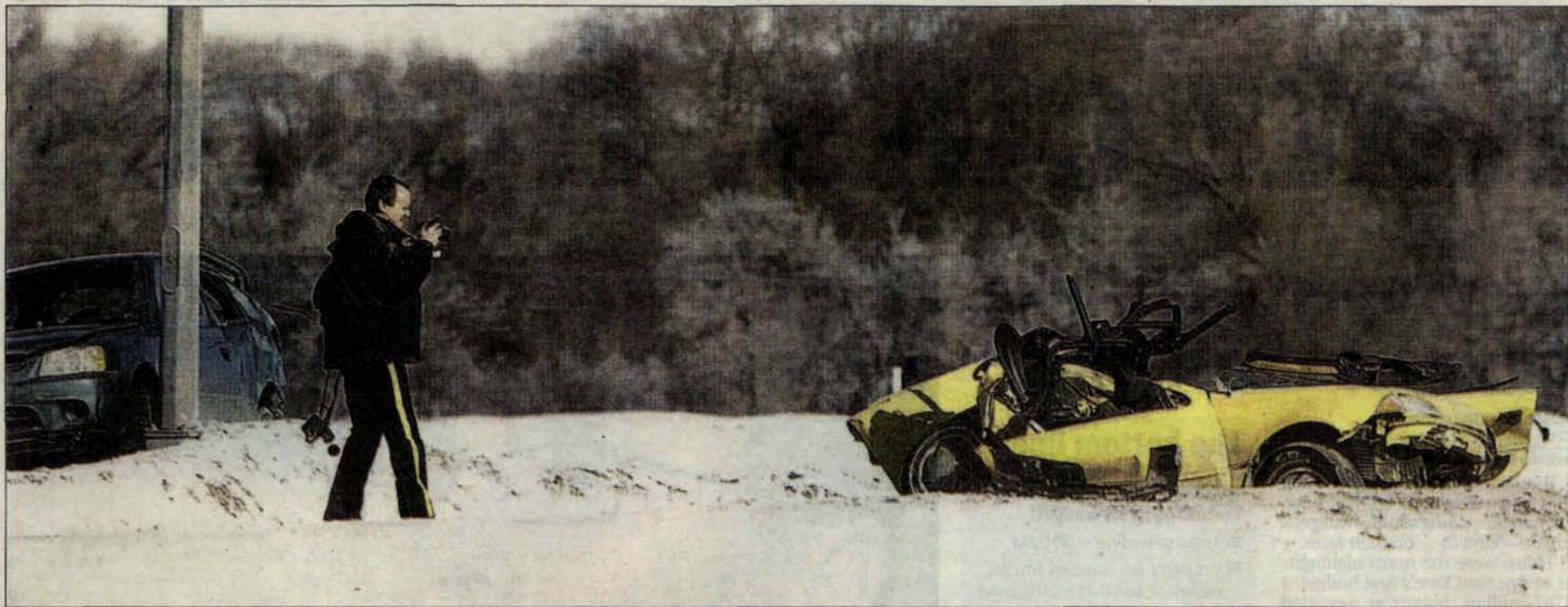
C. PROCAYLO Sun